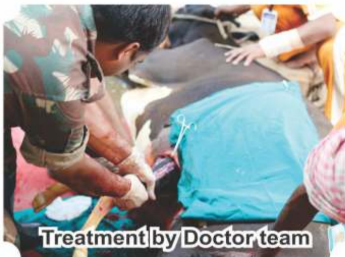
Treatment by Doctor team